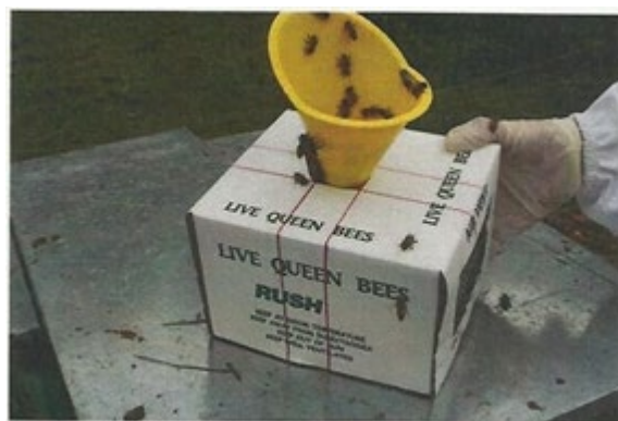
Figure 9: Gently tap live bee shipping box and funnel so bees are forced into the collection box.