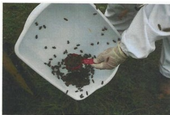
Figure 7: Collecting ¼ cup scoop of bees for sample.