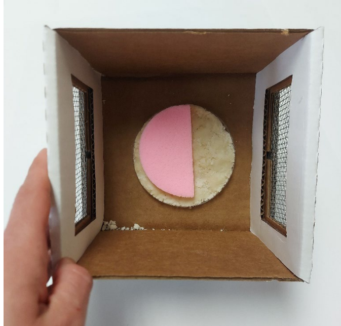
Figure 3: Bees require water and food during transport. Add queen candy to the petri dish, enough to cover (at least) half of the dish, and place a wet sponge on the other half (or on top of the candy).