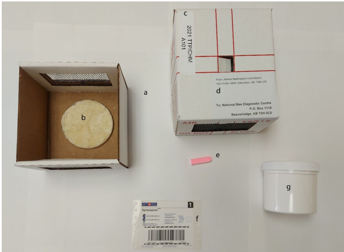
Figure 2. (a) Live bee shipping box, (b) candy, (c) apiary identification label, (d) address label, (e) sponge, (f) shipping label, (g) sampling vial (for Varroa sample x10).