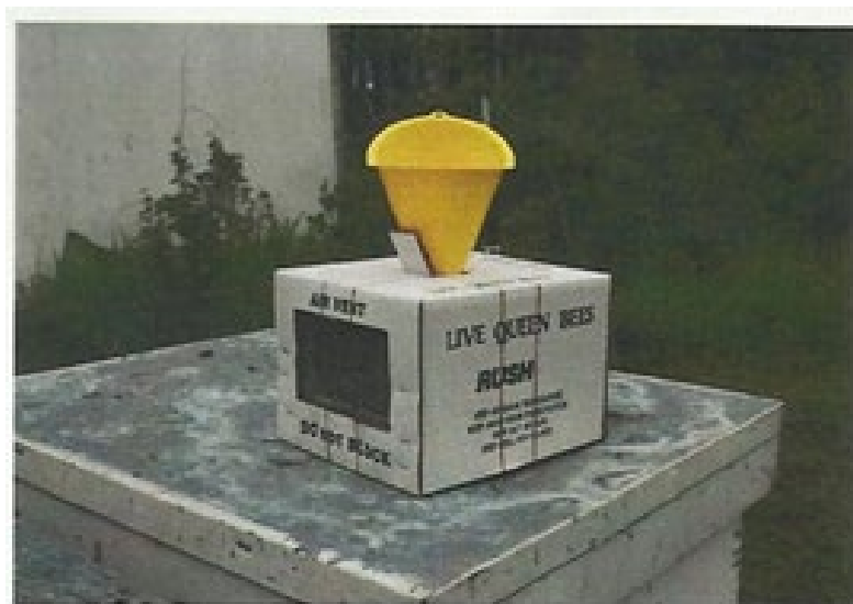
Figure 4: Live bee shipping box with funnel inserted to receive bees. This box should be set up and KEPT IN THE SHADE AT ALL TIMES after bees have been introduced, otherwise the sampled bees may overheat and die. Keep this box out of the wind.