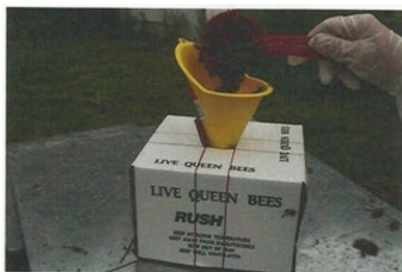
Figure 8: Place bees from cup into funnel inserted in the live shipping box.