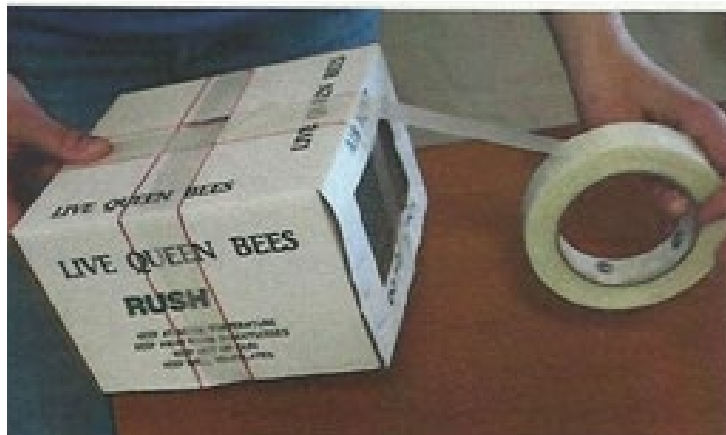
Figure 12: Secure the lid of the live bee shipping box to the bottom of the box using the provided transparent shipping tape.