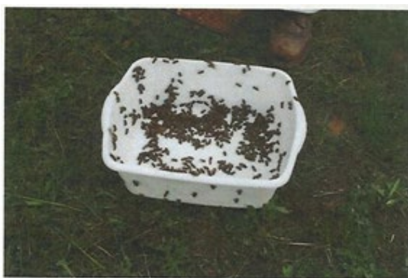
Figure 6: Removing bees from frame into wash tub.