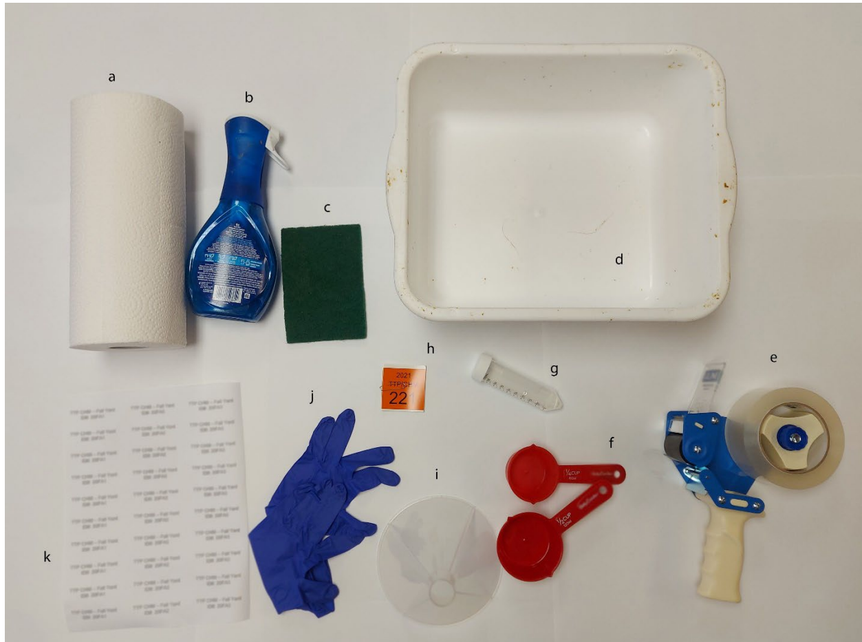
Figure 1: Equipment needed for sampling apiaries. Materials include: (a) paper towel, (b) soap, (c) sponge, (d) wash tub, (e) packing tape, (f) measuring cups, (g) water container, (h) colony tags, (i) funnel, (j) gloves, (k) varroa sample labels.

Also needed are basic beekeeping protective equipment (coveralls, veil, etc.), beekeeping tools (smoker, hive tool, etc.).