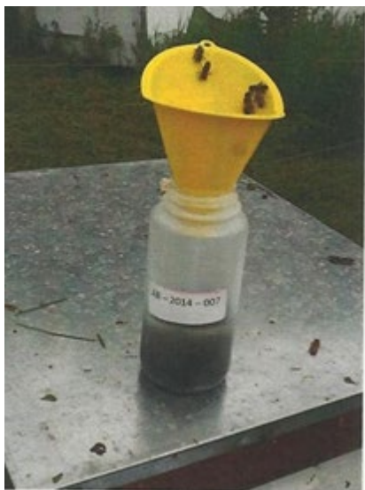
Figure 10: Place ½ cup of bees into the large alcohol vial.