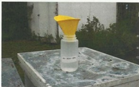
Figure 5: Large bottle with funnel ready to receive bee samples + alcohol (or winter windshield washer fluid)